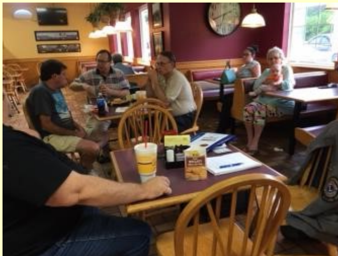
Zone 3 meeting at Dunbar Gino's

The September newsletter will announce the contest for the second quarter.