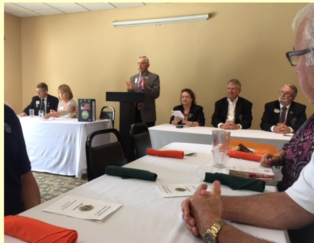
...photo of District Governor's Appreciation Banquet, 7-28-18...

Also, let me know if you need help, in any way, with your club.