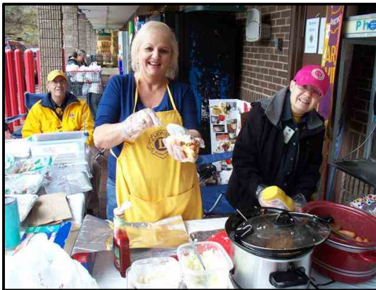
Good Dogs at Goodson's -- THAT IS, The Gary Lions sold over 300 Hot Dogs at their Hot Dog Sale at Goodson's this past August. The new cooker / steamer recently purchased for these sales worked great. Baked goods were also sold. That day the temperature was just as hot as the Hotdogs, with the temp hitting around 90. One gentleman commended the Gary Lions for helping his son get glasses a few years ago with the help of a club in North Carolina. He gave us a donation to express his appreciation. Lions civic pride was also noted this weekend with the Welch Lions sponsoring the Barrel Bowl. Money from this event stayed in McDowell Co.