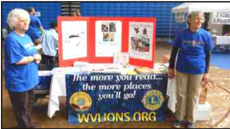
Read Aloud WV provided materials promoting reading for parents and magazines for children.

The Fairmont Lions Club was involved in several ways at the Family Literacy Fair, sponsored by the Marion County Board of Education,